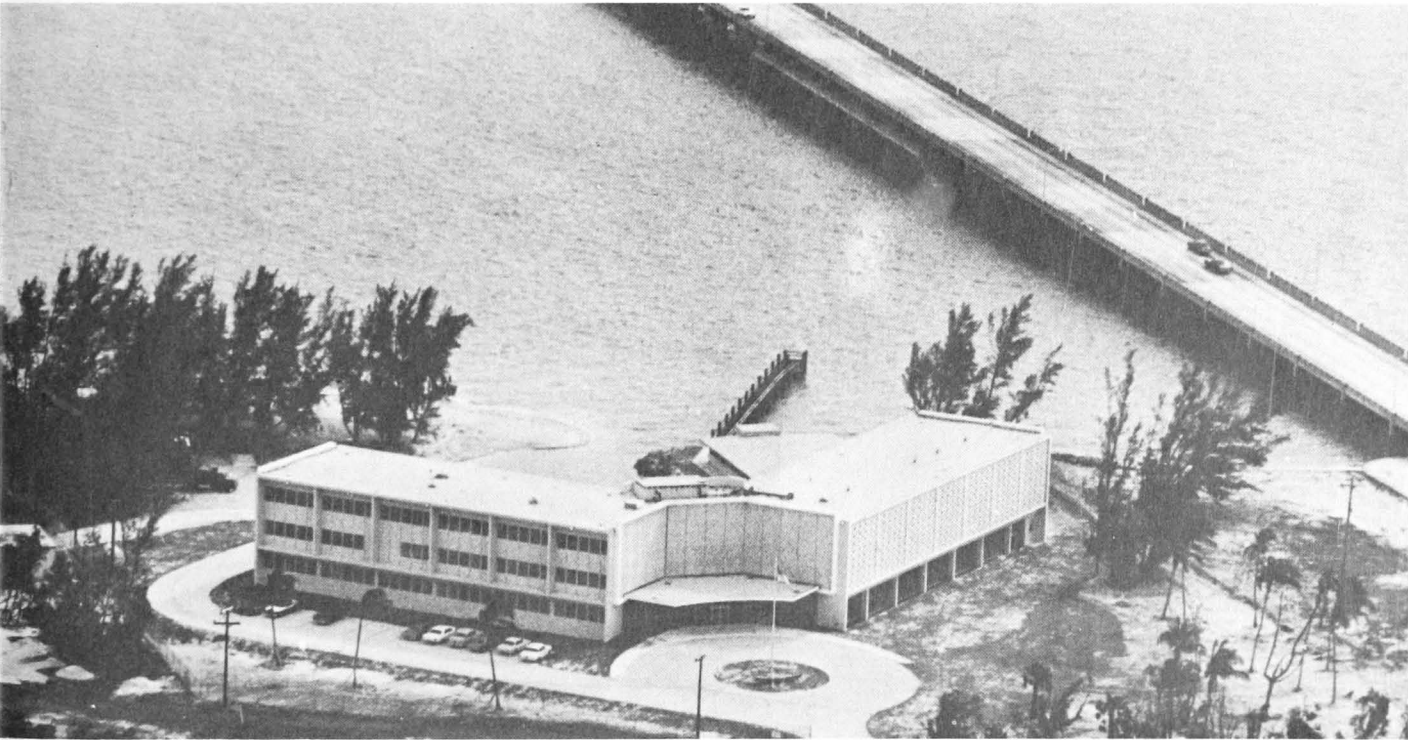
The Bureau's Tropical Atlantic Biological Laboratory, Miami, Florida. It is located on Virginia Key, a few minutes from downtown Miami.