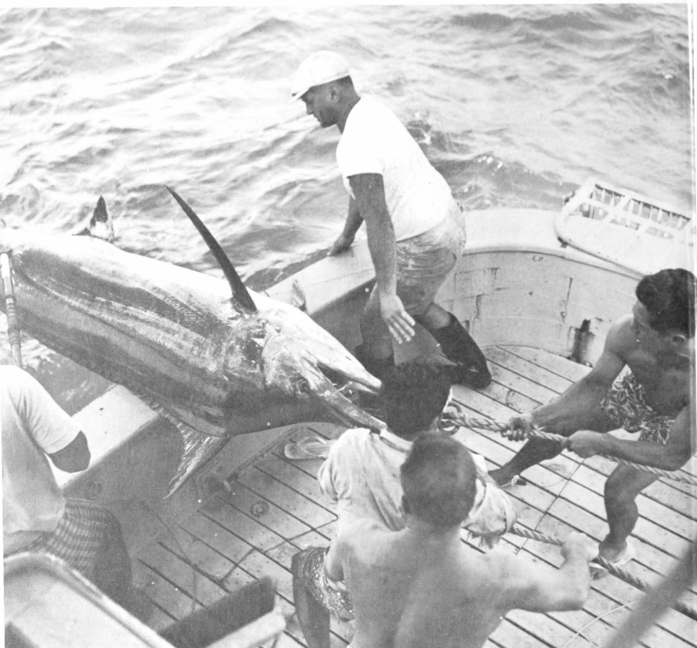
Marlin coming aboard a research vessel of the Bureau's Biological Laboratory in Hawaii.